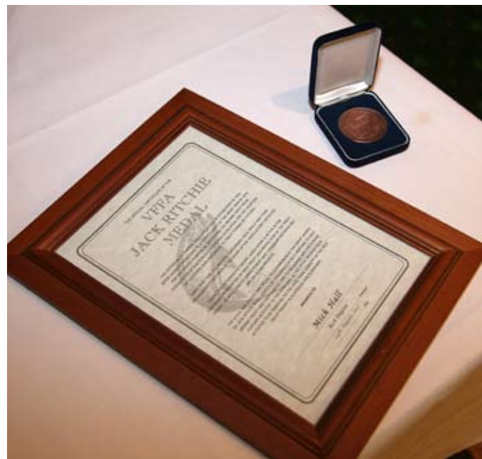
The Certificate and the Medal