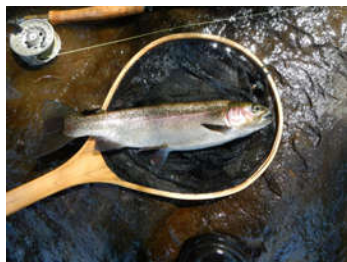
Healthy 43cm rainbow taken recently from the Collie River WA

The recommendations are broadly similar to the last few years with the exception that the decision to hold some yearlings for longer at the hatchery has meant there are fewer yearlings in total this year. The advanced yearlings will primarily be released into impoundments toward the end of the year. It is hoped the larger fish will be less likely to suffer the heavy predation from cormorants and pelicans that has been observed when standard sized yearlings have been released into these impoundments.