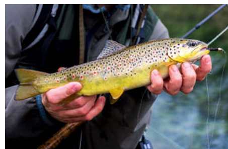
Brown trout

The Brown Trout ( Salmo trutta ) is a native of Europe ranging from Iceland in the west to Russia in the east. The species is also native to Turkey, Afghanistan and Armenia.