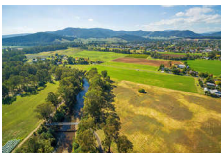
Ovens River Myrtleford

A. 6th & 7th April 2019 at Myrtleford. Event Headquarters will be at Nimmo Bridge Recreation Area, Buffalo River Road, Myrtleford.