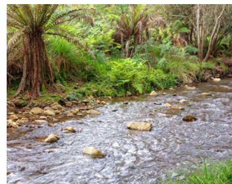
Ovens River in Autumn

We look forward to meeting and greeting lots of recreational anglers at the Event, and we wish you "Tight Lines, Screaming Reels, and a few Lucky Casts".